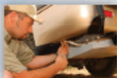
TOYOTA LANDCRUISER COMBO FUEL - WATER TANK