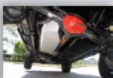
JEEP WRANGLER JK AUXILIARY FUEL TANK