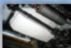
MAZDA BT50 - FORD RANGER REPLACEMENT FUEL TANK