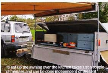
To set up the awning over the kitchen takes just a couple of minutes and can be done independent of the tent