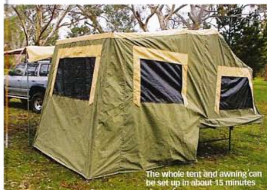
The whole tent and awning can be set up in about 15 minutes