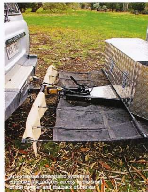
An extensive stoneguard system is effective, but reduces access to the front of the camper and the back of the car