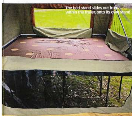
The bed stand slides out from within the trailer, onto its own stand