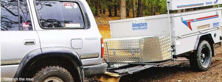
Through the mud