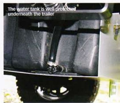
The water tank is well protected underneath the trailer