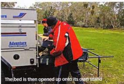
The bed is then opened up onto its own stand