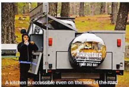
A kitchen is accessible even on the side of the road