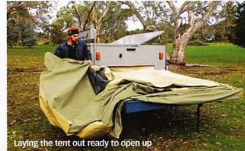
Laying the tent out ready to open up