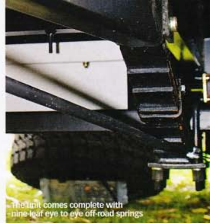
The unit comes complete with nine-leaf eye to eye off-road springs

A: I would definitely recommend this trailer – it's got heaps of storage room, the kitchen is fantastic, and most of all you can't break it, it's as tough as you can get. Paul (from Adventure Offroad Campers) is fantastic to deal with, very professional and has also provided fantastic after-sales service.