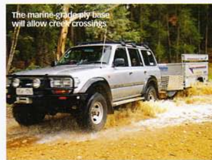
The marine-grade ply base will allow creek crossings